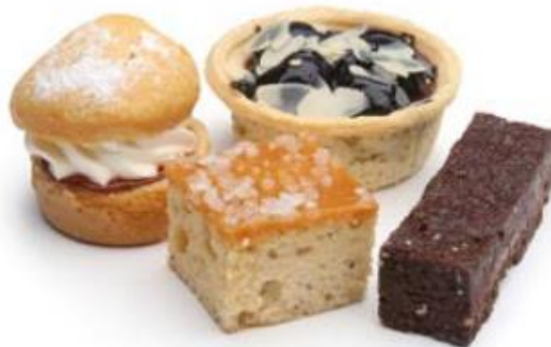
VEGAN TEA TIME MIX BOX